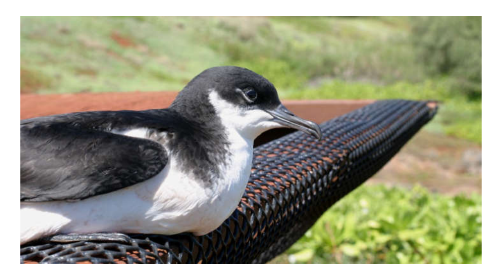
Figure 2 – Newell's Shearwater, note it is a black over white bird with a long relatively narrow bill and black and blue feet.

On the ground the species are distinctive, though can be difficult to identify to species level by an untrained observer. The following four images depict these species on the ground or in the hand.