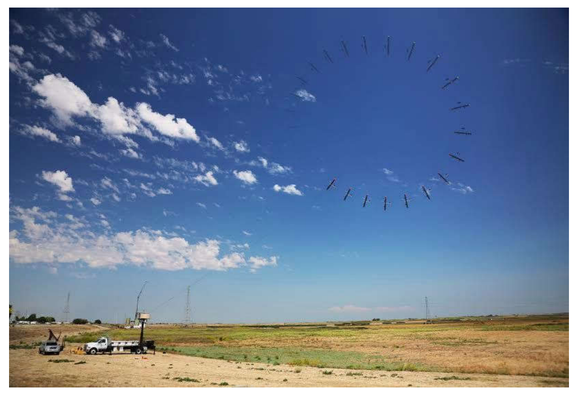
Layered photographs of the kite in flight around different points on the crosswind loop illustrate the flight path of Makani's "Wing 7" 20kW prototype operating in California, 2013.

Makani has been researching and developing energy kites since 2006. Beginning with soft fabric kites that powered generators on the ground, Makani's researchers found out early on that rigid kites could more efficiently harness energy from the wind. From 2012-2015, the team fabricated and tested "Wing 7," which is a subscale prototype to the M600. Wing 7 validated the concept for controls, aerodynamics and power generation and operated for roughly 100 hours. In December 2016, Makani first generated electricity in crosswind flight with the M600 at a test site located on the China Lake Naval Air Weapons Station in California's Mojave desert.