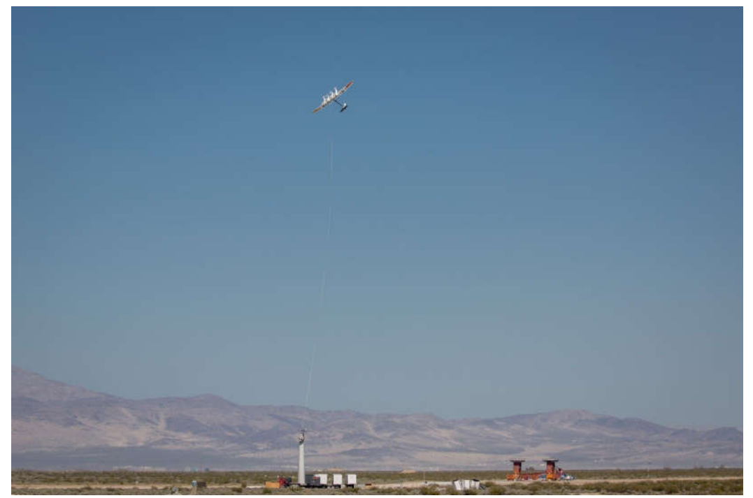
Makani's "M600" 600kW prototype operating in California, 2018.