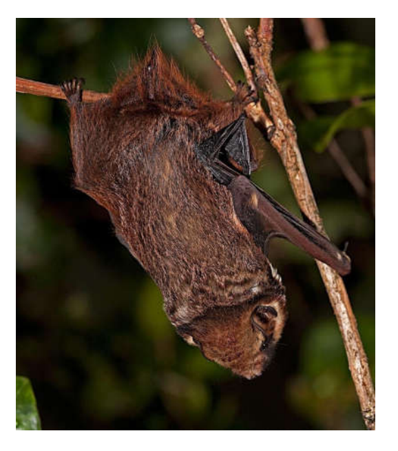
Figure 6 – Adult Hawaiian hoary bat