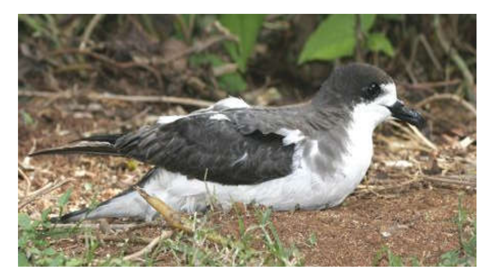
Figure 3 – Hawaiian Petrel note the relatively larger size than the previous species, heavier, thicker bill and less clean demarcation between the black and white areas on the bird