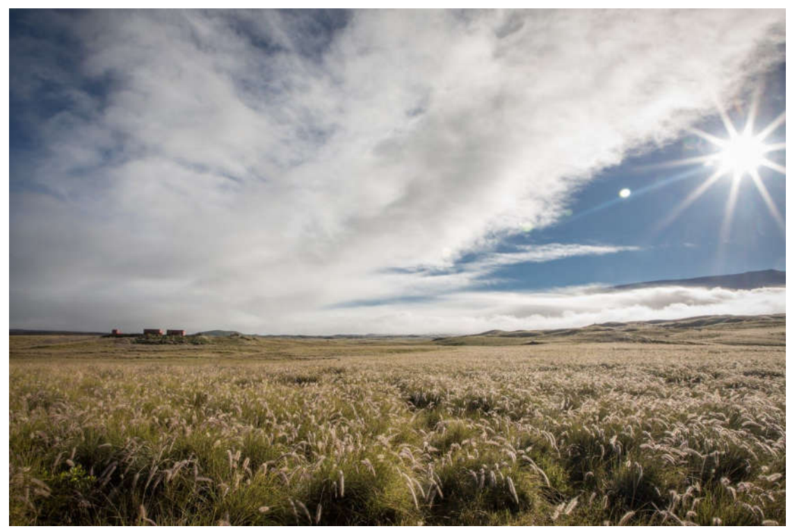
The Makani test site on Parker Ranch Pasture land, 2017

Vegetation on the site is best characterized as pasture land predominately vegetated with a mix of alien pasture grasses and weedy species typical of pasture lands in the general Waimea area on the Big Island.