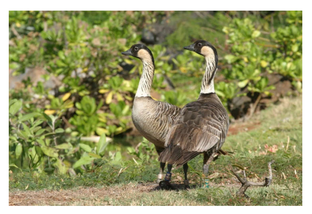
Figure 1 – Adult Nēnē

Nēnē, are an iconic species and are easily identified even by the most untrained of observers (Figure 1).