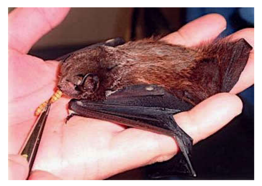
Figure 7 – Sub-adult Hawaiian hoary bat