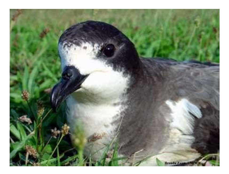
Figure 4 – Hawaiian Petrel note the relatively larger and shorter bill size than the previous species. Also note the less defined demarcation between black and white parts of the bird

Figure 3 – Hawaiian Petrel note the relatively larger size than the previous species, heavier, thicker bill and less clean demarcation between the black and white areas on the bird