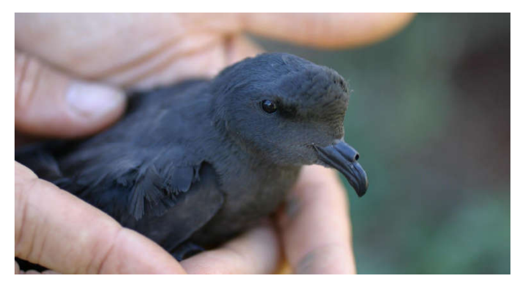
Figure 5 – Band-rumped Strom-Petrel, note the tiny size, totally dark coloration, small tubenosed bill.